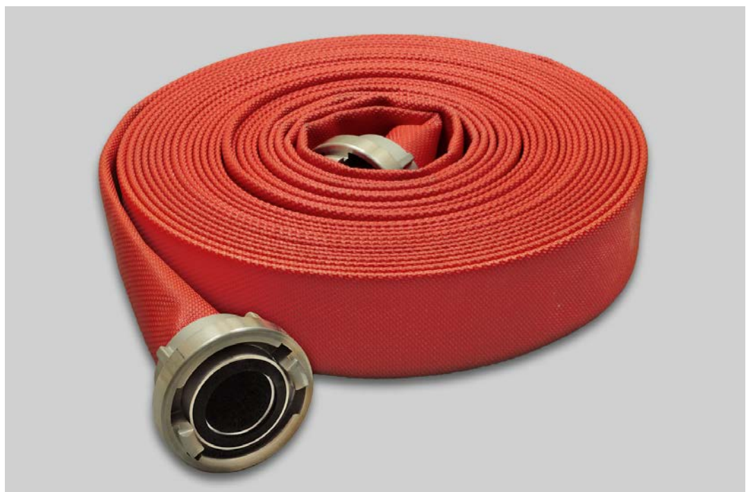
Syntex 500 PU (outside coated)

permanent quality assurance in the own test laboratory